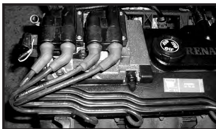
Part Number: 4_444