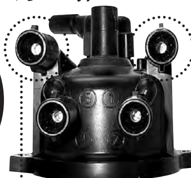
B) 5mm type distributor

Note: Lugs for clip fittings on 5mm type cap and note smaller diameter terminal/cavities