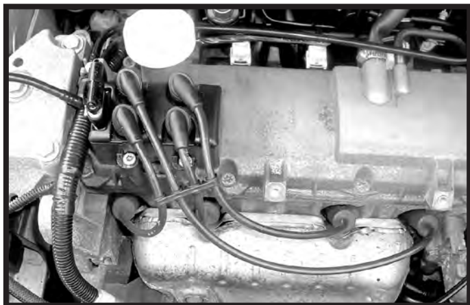
Part Number: 4_232

Due to production date/model over-rides, Magnecor are unable to clarify the type of Ignition Systems/lead sets used on the various Megane 1.6i SOHC 8v engines. Please refer to the pictures below to verify which lead set your customer requires, then refer back to the application/part numbers under the Manufacturer for the prices.