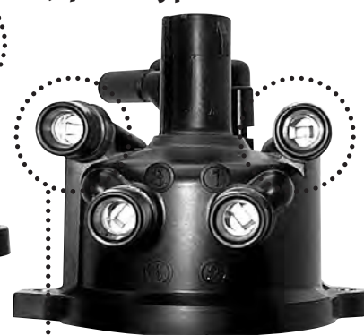
C) 7mm type distributor

Note: Larger terminal holes/cavities for 7mm type cap and note absence of lugs